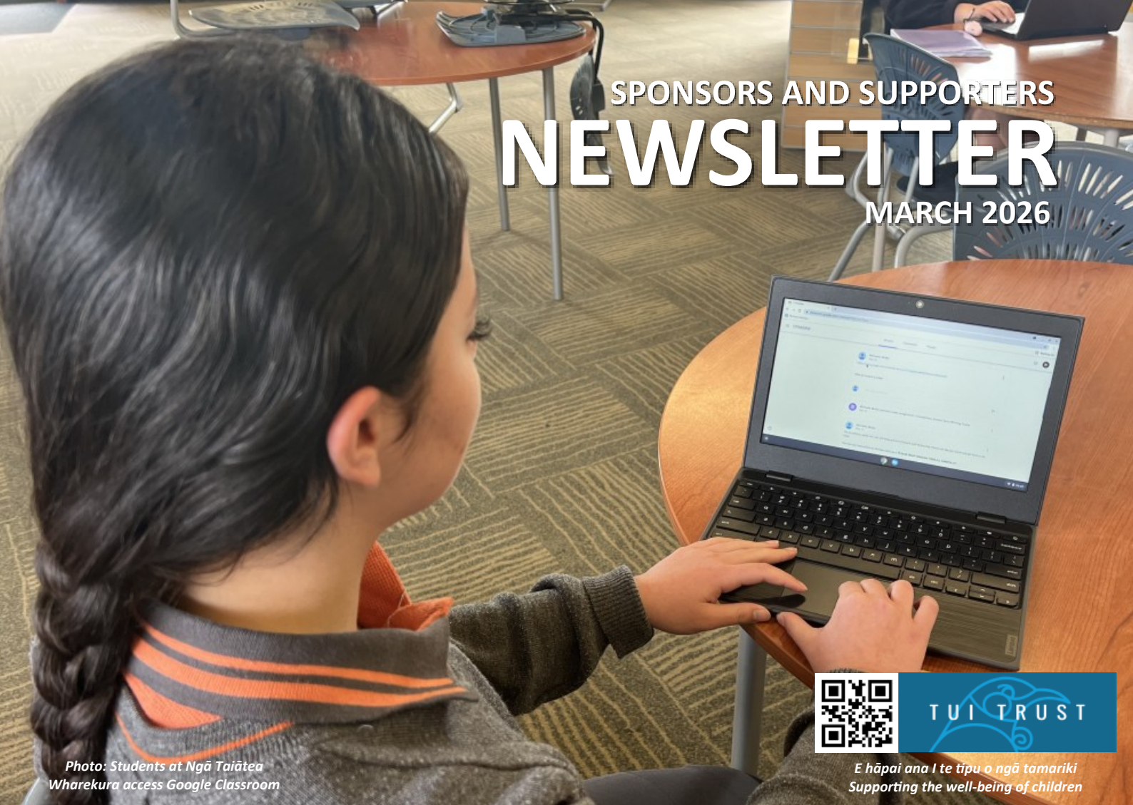
Photo: Students at Ngā Taiātea Wharekura access Google Classroom